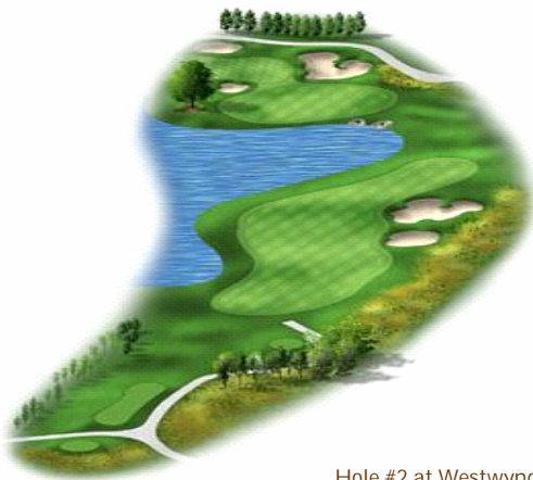
Hole #2 at Westwynd

TEAM UP WITH YOUR HIGH SCHOOLERS FOR A MEMORABLE DAY!